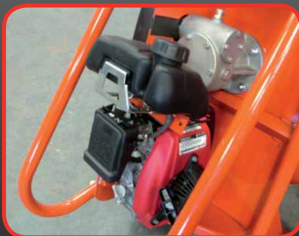
Large choice of Engines & Motors