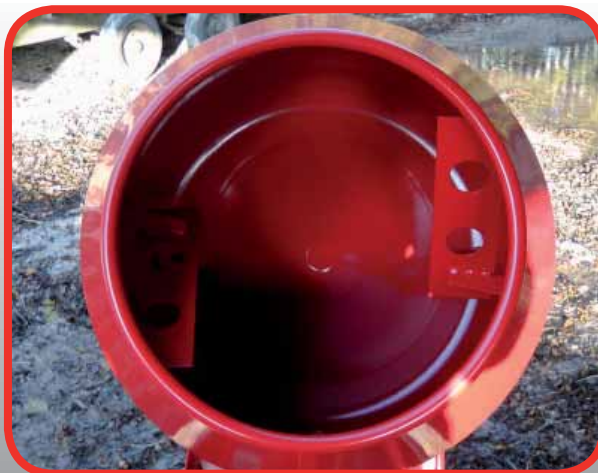
New Quick-Mix Drum