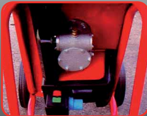
Heavy-Duty, sealed cast Gearbox