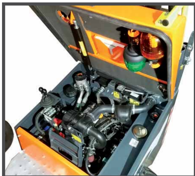
GOOD ACCESS TO KEY FEATURES WITH SELF-LOCKING GAS STRUT AND PROVEN YANMAR 3TNV76 DIESEL ENGINE