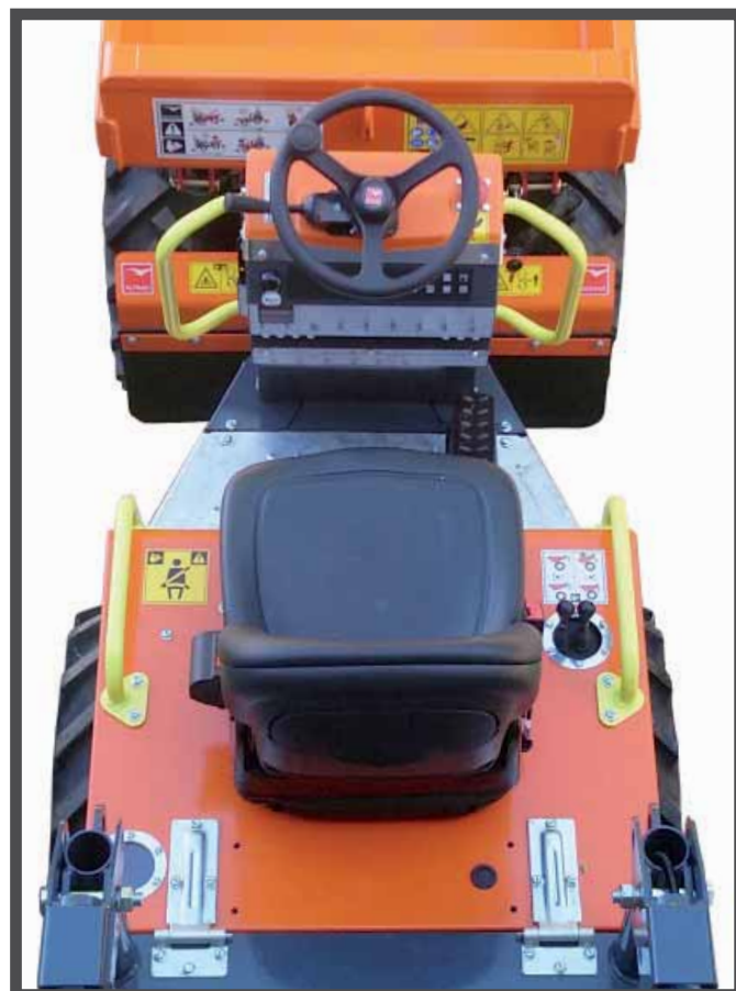
ERGONOMIC OPERATOR STATION WITH EASY-TO-REACH CONTROLS, LEADING BRAND COMFORT SEAT AND GOOD ALL-ROUND VISIBILITY