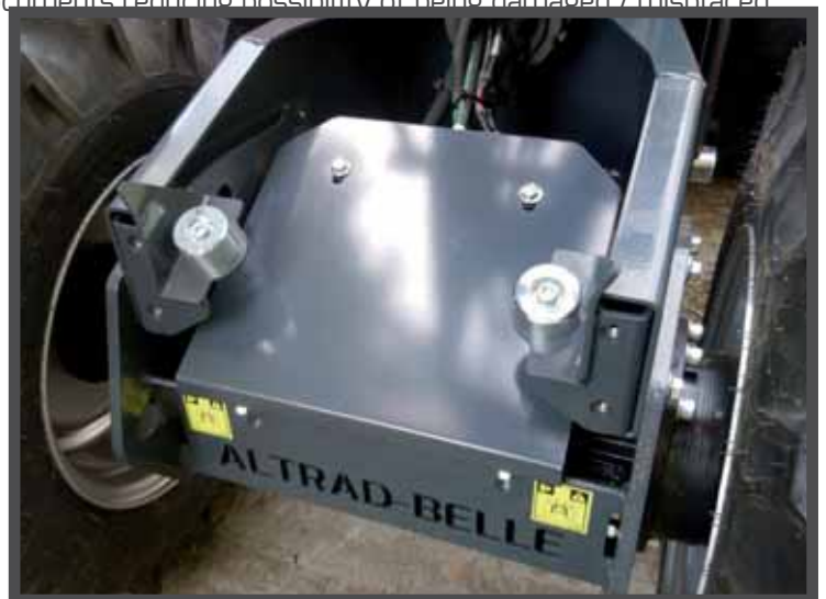
ROBUST STEEL, FRONT MATERIAL INGRESS GUARD PREVENTS DAMAGE TO HYDRAULIC CIRCUIT