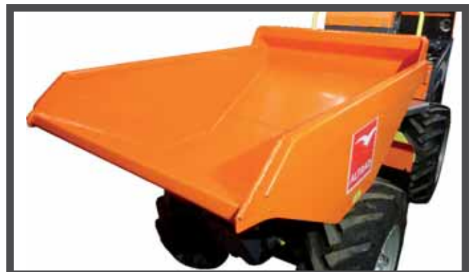
ROBUST, EASY-CLEAN 1000KG CAPACITY SKIP FULLY RETURNED EDGES TO PREVENT DIRT INGRESS