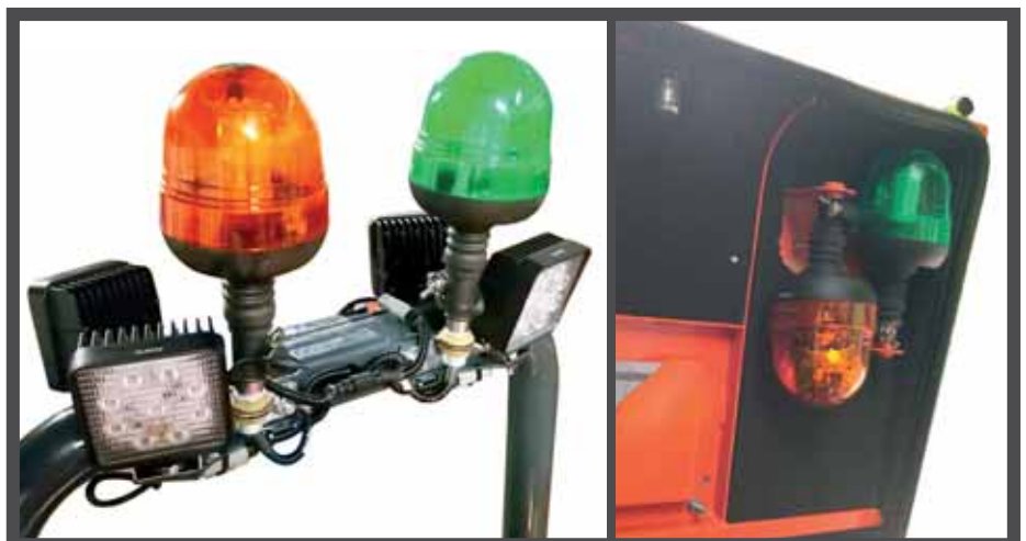
GREEN BEACON OPTION , 2X & 4X WORK LIGHT OPTIONS WITH LOCKABLE UNDER-CANOPY BEACON STORAGE