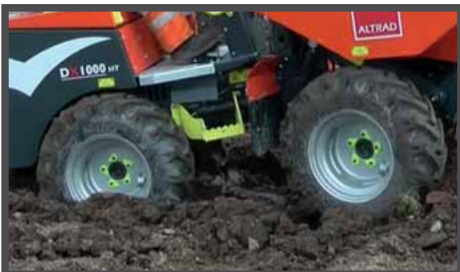
HIGH-QUALITY, ALL-TERRAIN TYRES WITH VALVE PROTECT GUARD & WHEEL NUT INDICATORS